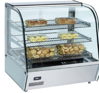
RTR-120L 120 Litre Hot Displays 120 Litre