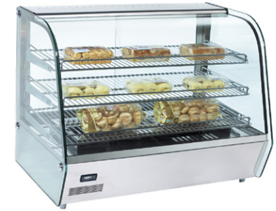
RTR-160L 160 Litre Hot Displays 160 Litre